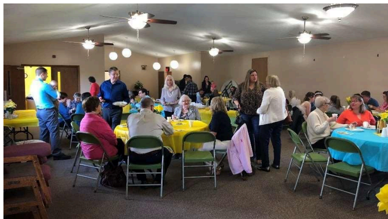
~ The Fellowship Hall ~