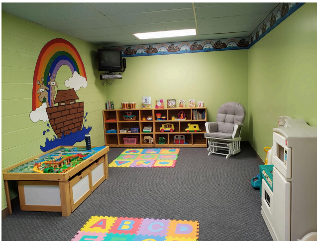
~The Nursery ~