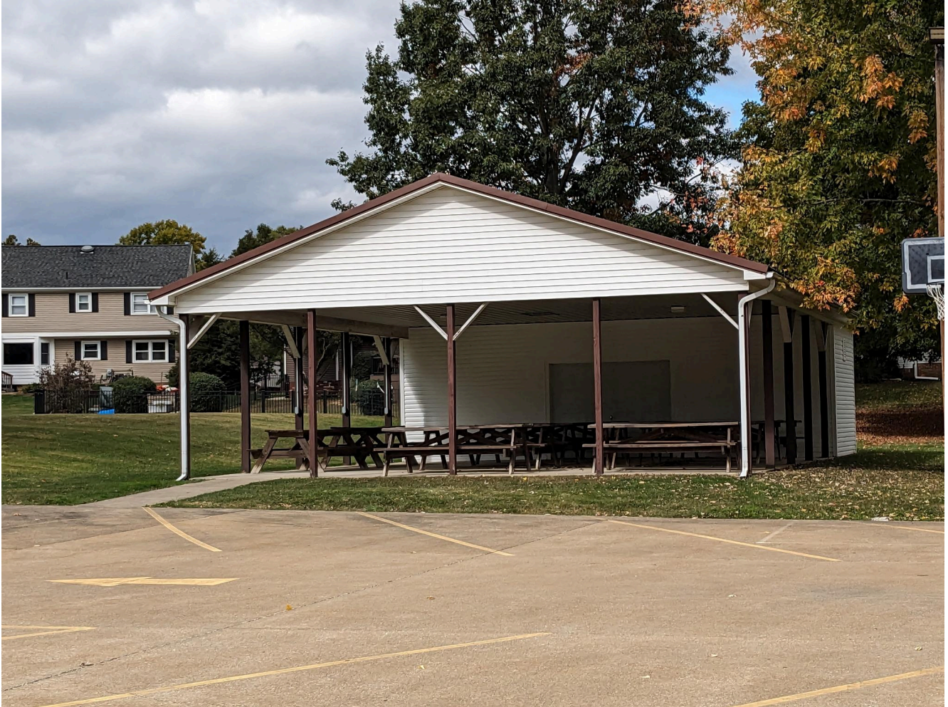
~ The Picnic Shelter ~