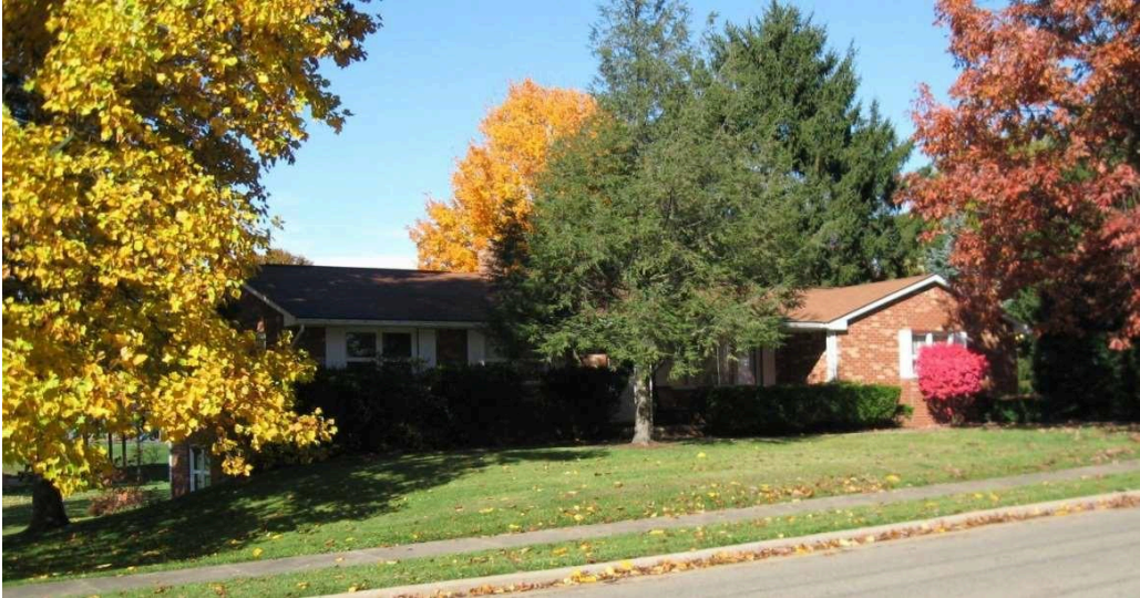
~ The Parsonage – Front View ~

The church owns a parsonage on the property that is rented out to a group home. Therefore, a housing allowance is provided as part of the compensation package for the pastor.