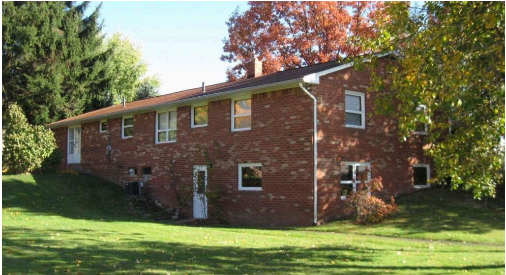
~ The Parsonage – Rear View ~