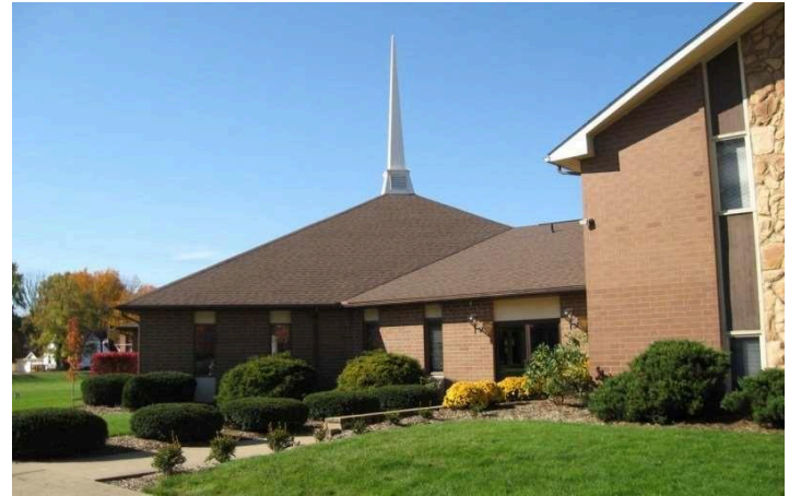
~ The Sanctuary ~

Our sanctuary is a beautiful brick structure with stained-glass windows which seats 200-300. It is diamond shaped with the pulpit and chancel area at the point allowing the seating to be closer. The building is fully air conditioned with adjustable lighting, sound system equipped to handle a praise band, audio control booth and computer graphics center, and cameras for livestreaming to the Internet. The baptistry is behind the chancel area and is accessible from two dressing rooms with restrooms. At the back of the sanctuary and separated by a glass wall is the narthex/lobby where we visit with one another prior to and following services.