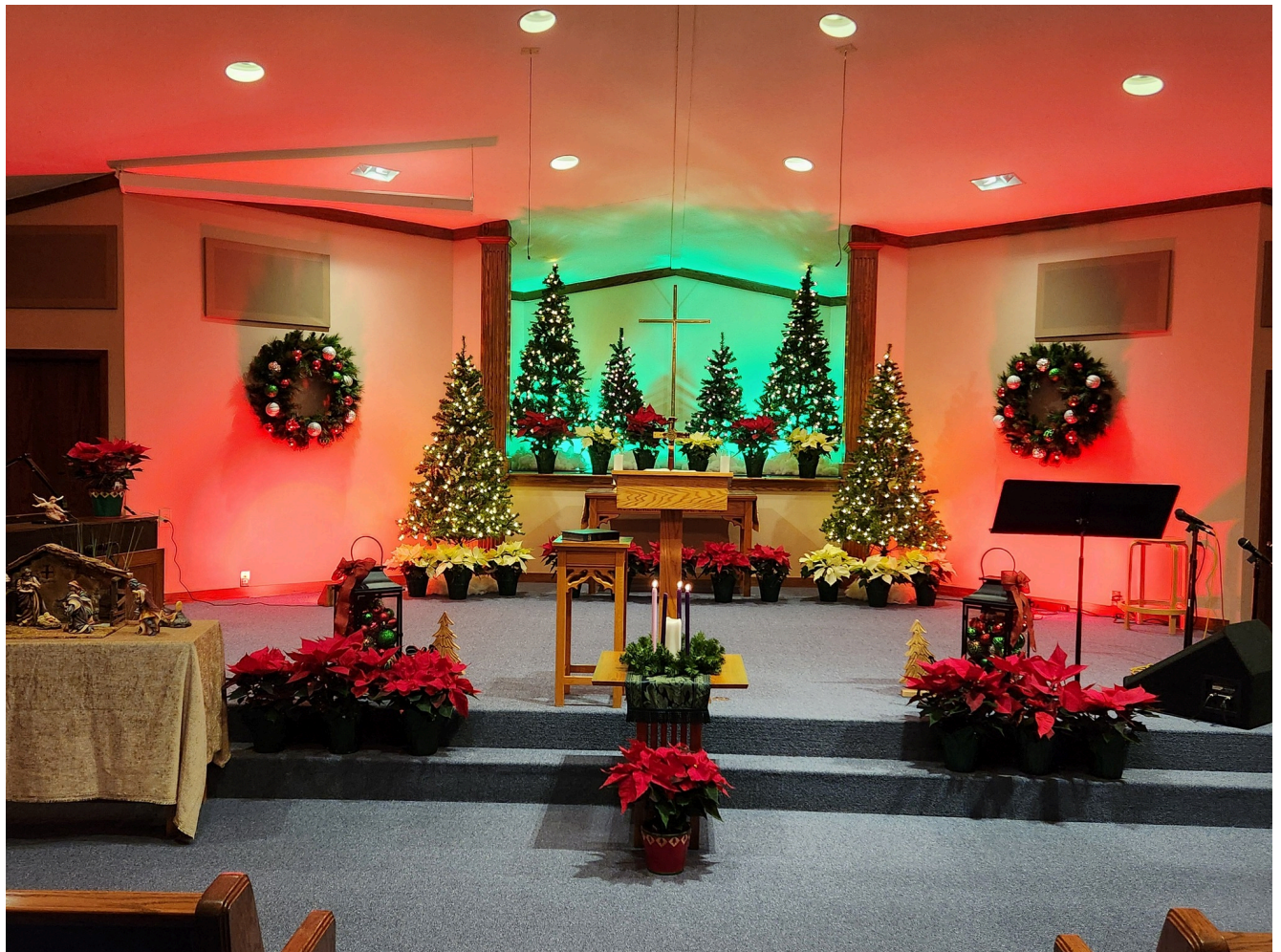
~ The Sanctuary ~