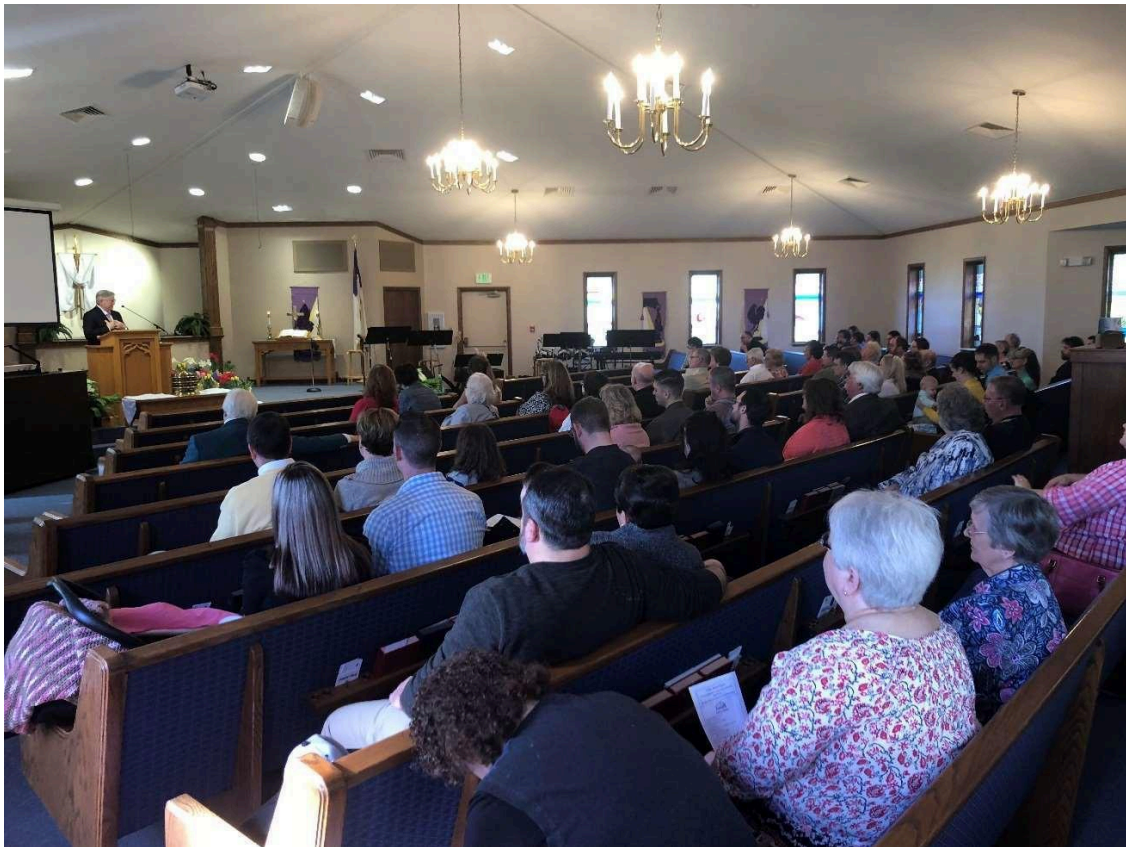
~ The Sanctuary ~