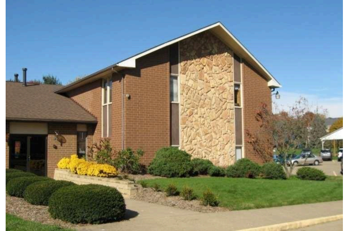
~Original Building ~

All of our church buildings and property are mortgage-free. Our first completed brick building now houses the pastor's study, office, two classrooms, library, nursery and restrooms on the first floor. On the second floor is our fellowship hall, with table seating for up to 120, a fully-equipped kitchen, classroom and restroom. A lift to the second floor was added in 2019.