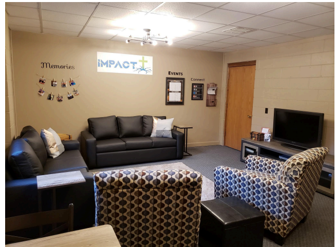
~The Youth Classroom ~