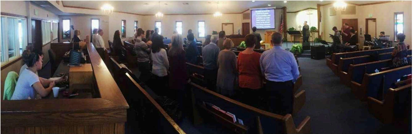
~ The Audio/Video Control Center and Sanctuary ~